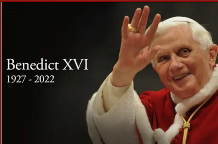
Benedict XVI 1927 - 2022

We join the Church in mourning the passing of Pope Emeritus Benedict XVI.